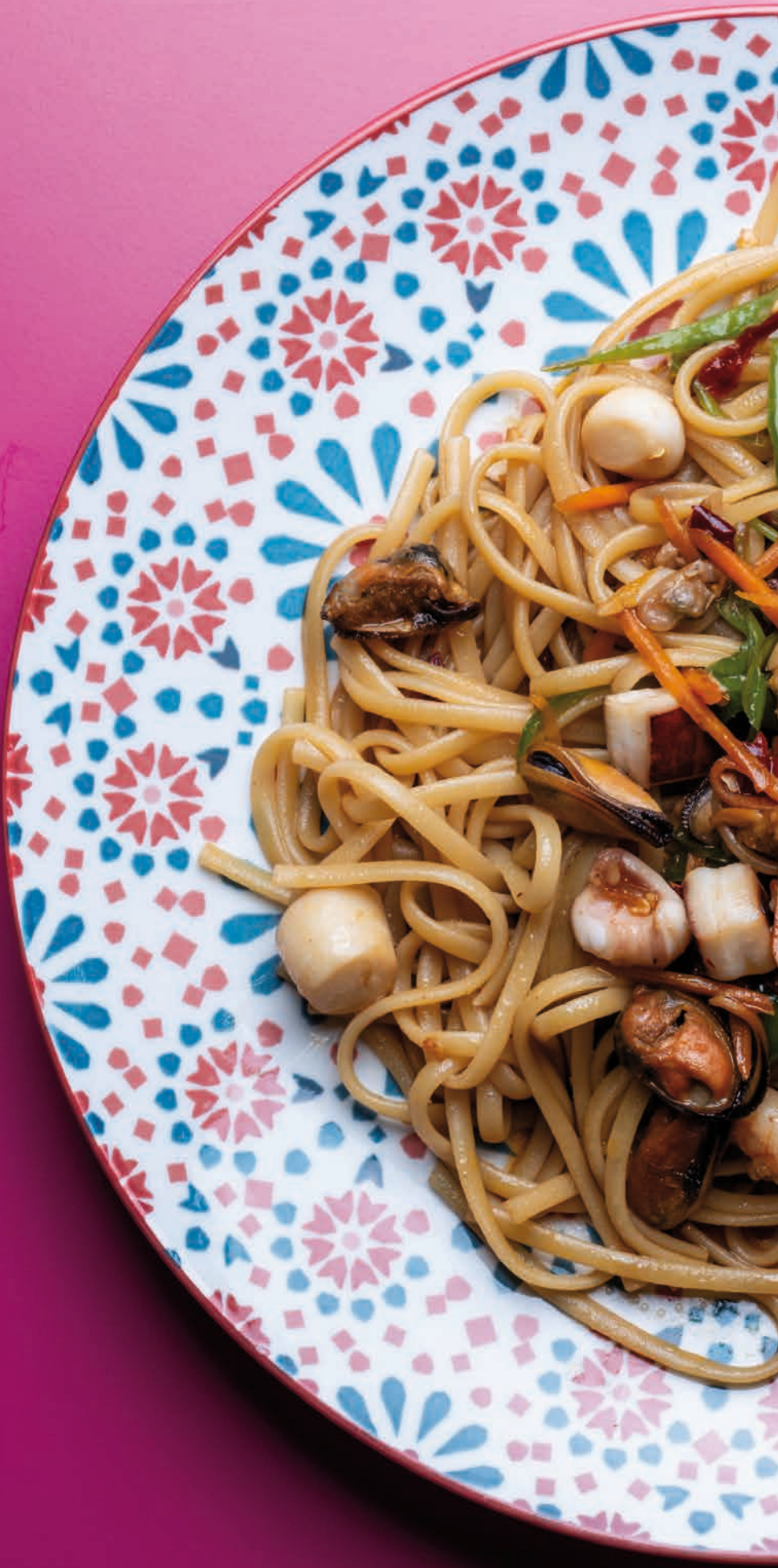
SPAGHETTI WITH BASIL SEAFOOD